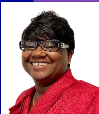
MINISTER DIANNE WEEKS